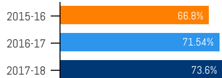
Rate of Patients with Blood Pressure Control